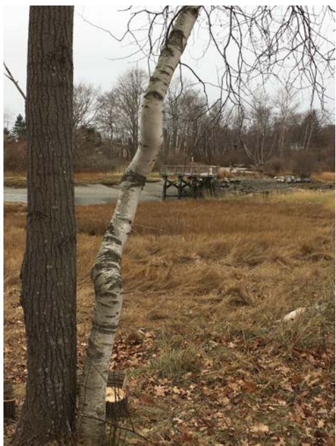
Projects approved for 2020